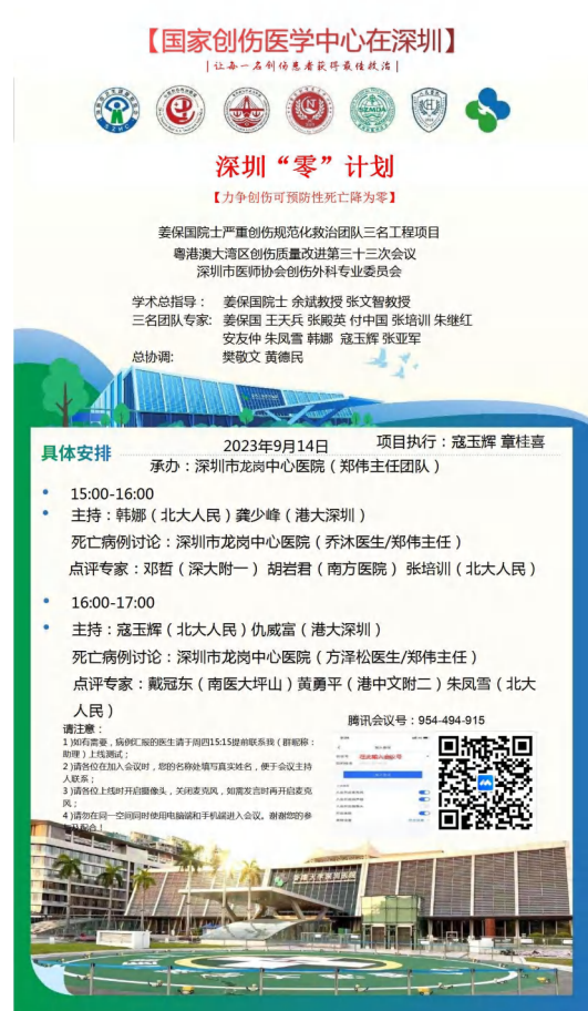
Fig.1 Notification of one of the meetings

Fourteen trauma centers in Shenzhen participated in 9 times online trauma related death audit meetings (Fig.1, Fig.2) from Aug. 31, 2023 to Dec. 31, 2023. The expert group participating in these meetings consists of 8 to 10 specialties including general surgery, orthopedics, emergency medicine, neurosurgery, and intensive care units. Standardized form (Fig.2) was used to document the patient's treatment process and details in every case during the meeting. The final determination of whether the deaths were preventable and the agreed-upon measures for improvement were documented with the consent and signatures of each member of the expert groups.